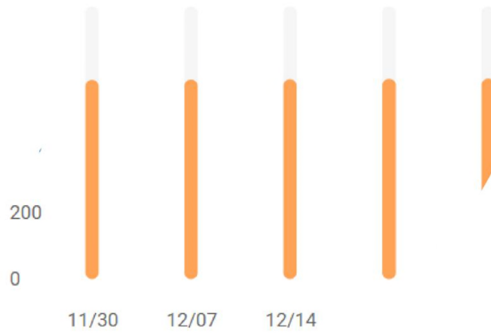
Secure Score Trend